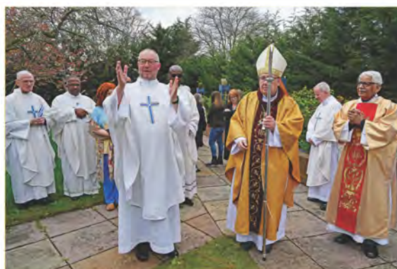
SYNOD NEWS Journeying Together , Page 7.