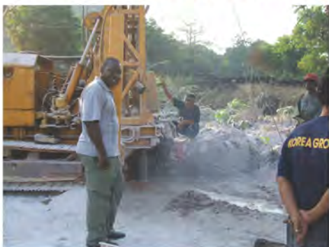
Articles, Page 4.

For fourteen years a charity in Sheffield has been working with partners in the north of Sierra Leone, West Africa.